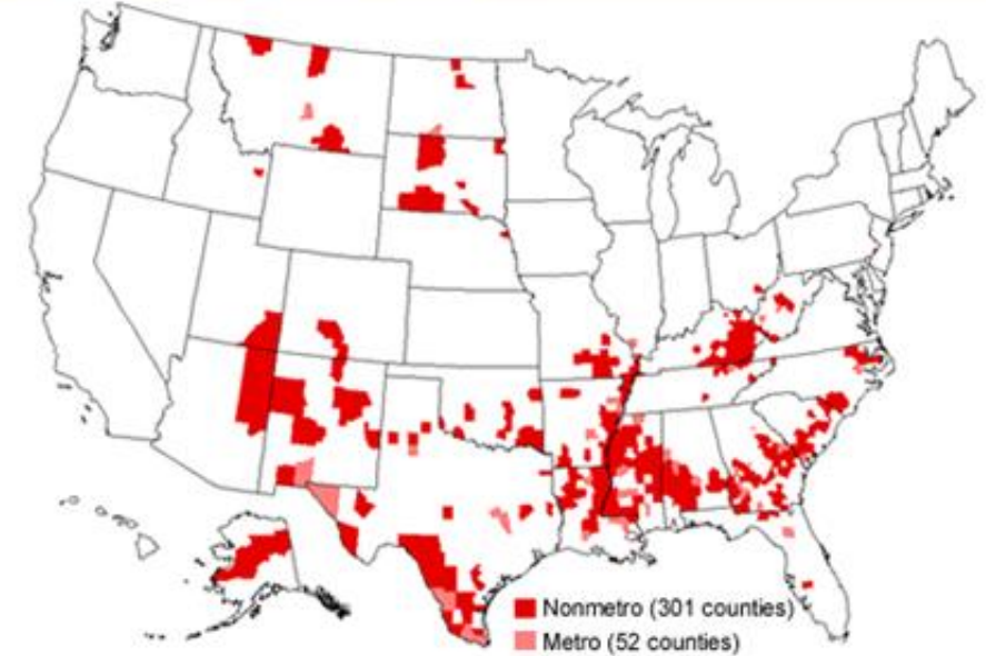
Persistent-poverty counties, 1980-2011

Note: Persistent-poverty counties had a poverty rate of 20 percent or higher in decennial census years 1980, 1990, and 2000, and in 2007-11 (American Community Survey). Metro/nonmetro status is based on 2013 definitions.